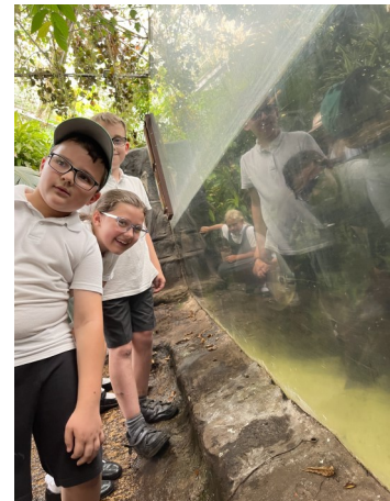
Year 4 visit to the living Rain Forest. New Year R play equipment 'opening'.