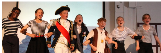
The Year 5/6 Production