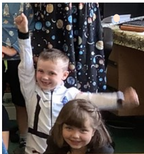
Year 2 Maths and Space Day