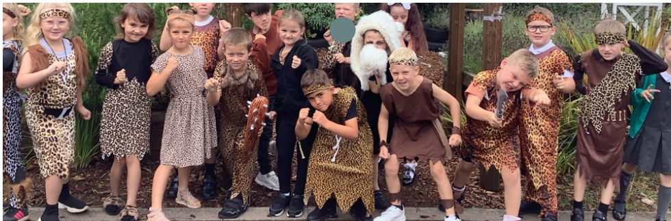
Year 3 and 4 Stone Age Day, Roman Day and Mosaics